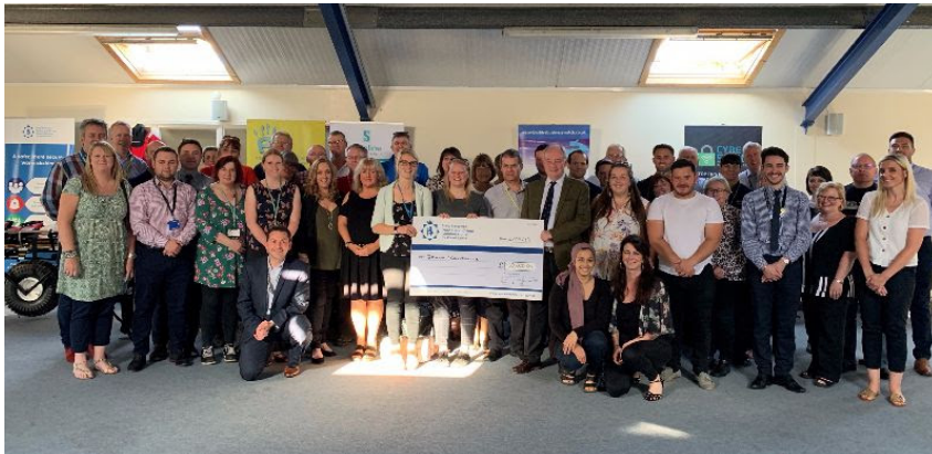
2019 PCC Grant Recipients

Projects to keep communities safe, deter re-offending and divert young people away from anti-social behaviour are among the schemes in Warwickshire being given a £1 million boost by my annual grants scheme.